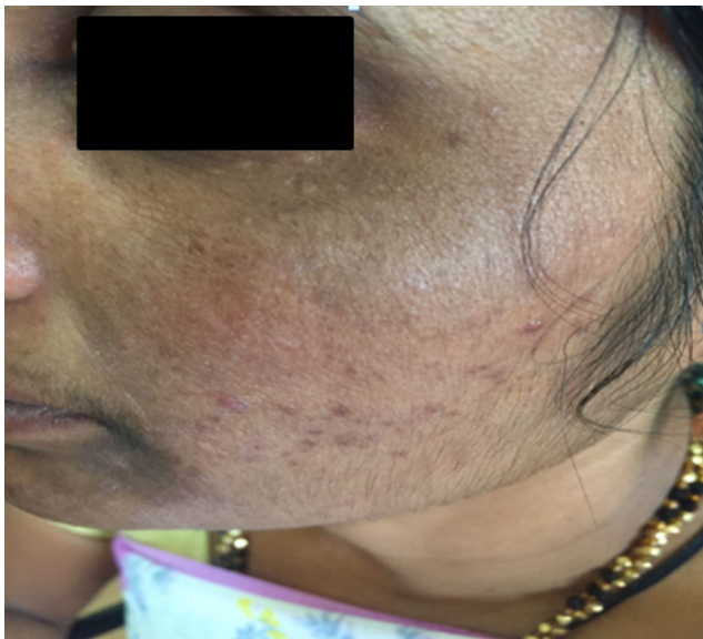
Fig. 4: Hypertrichosis in a 29 year old female with hypertrichosis and acneiform eruptions.