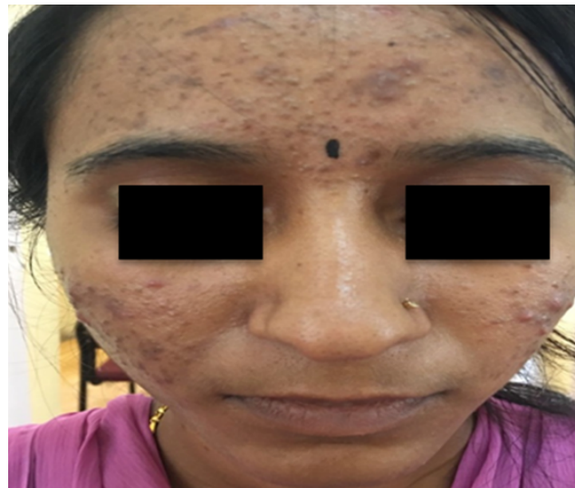
Fig. 2: A 24 year old female developed acne with hyperpigmentation due to topical

In the current study, majority of the patients (29%) misused TC for more than a year while 4% patients used the preparation for <1 week, 19% for less than 1 month, 22% of them used it for duration of 1 month to 3 months, 17% for a duration of 3 months to 6 months, 9% for 6 months to 1 year. Contrary to our study, a study conducted by Saraswat A et al, showed that majority of patients (117;27%) used the topical steroids for a period of 1 month to 3 months, with only 92 (21%) patients using TC for more than a year. 13 In a study by Bains P et.al duration of application of topical corticosteroids was <6 months (45%) in majority of patients. 14