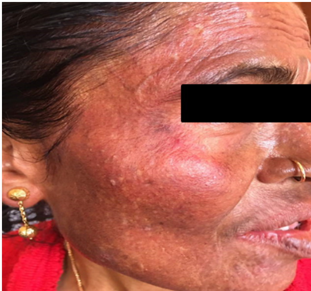
Fig. 3: Diffuse erythema and telangiectasia in a female who was on topical corticosteroid abuse for more than a year

Figure 3-5: Adverse cutaneous effects of topical corticosteroids on face