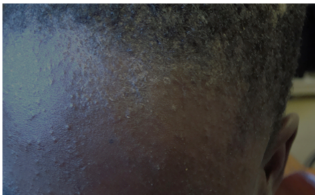
Fig. 2: Id's reaction (dermatophytid reaction). Multiple papulovesicular lesions on forehead.

Endothrix invasion of hair was seen. It looks like a bag of marbles (Figure 3b). The plates were incubated at 25°C and multiple violet waxy colonies were seen after two weeks (Figure 3 a).