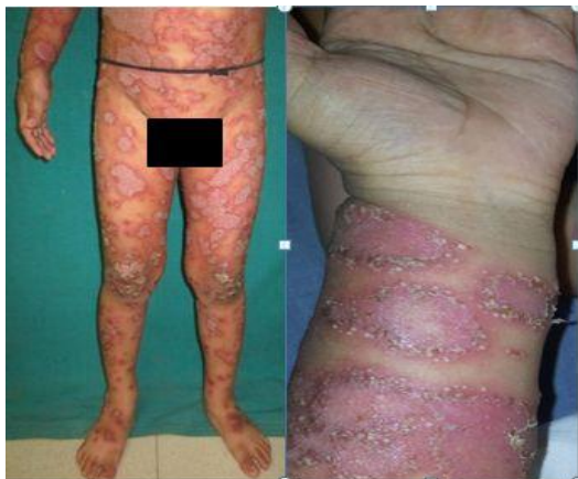
Fig. 1: Well defined annular erythematous plaques surrounded by a rim of few mm size pustules present over trunk and extremities and flexor aspect of forearm