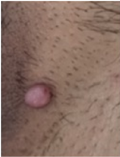
Fig. 1: Skin colored nodule of 1x1cm over the vulva