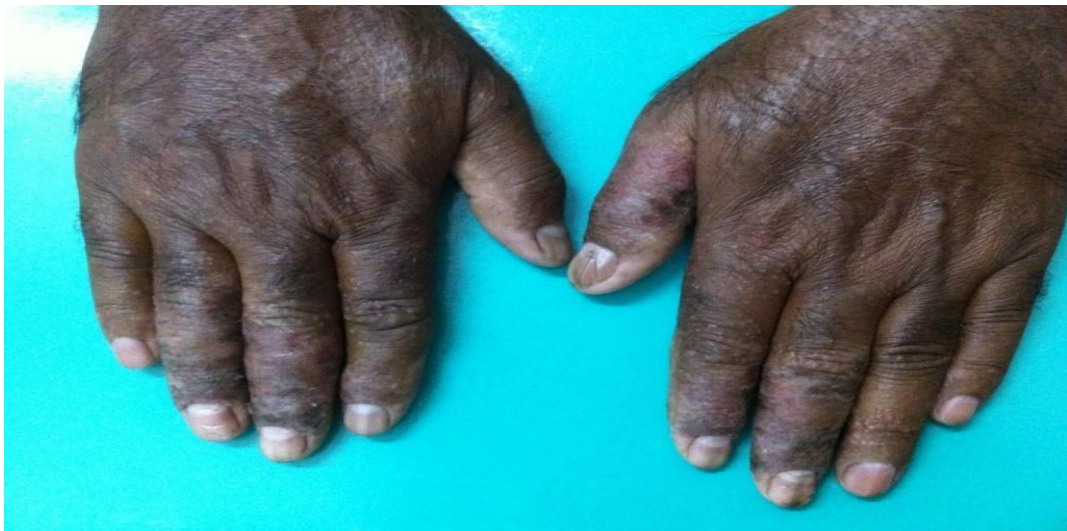
Fig. 1: Shows vesiculo squamous type of Hand eczema