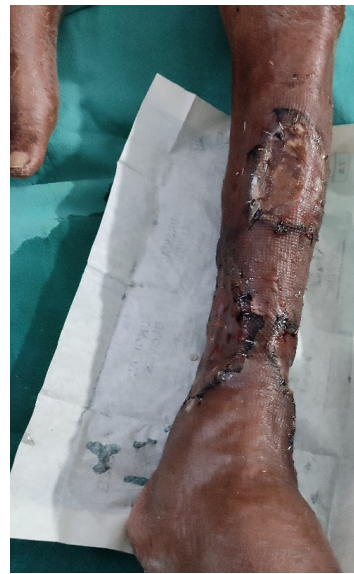
Fig. 4: Also skin graft applied in a single stage