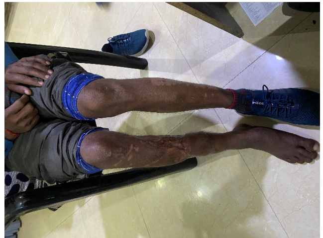
Fig. 10: Fig. 10: single stage matriDerm® + skin graft to cover exposed bone with 2cm breadth devoid of periosteum and soft tissue + pedicled flap to cover fracture site with Five months follow-up.