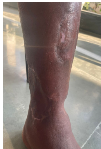
Fig. 5: 3 months follow-up.