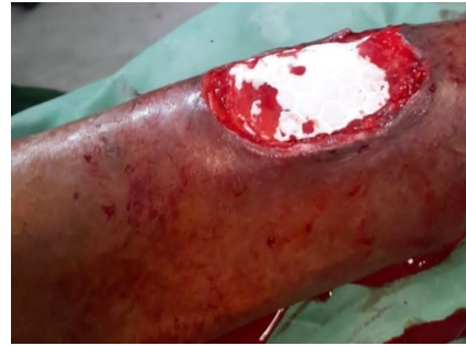
Fig. 3: MatriDerm® applied

The twenty-four-year-old male had a crush injury to his right lower limb. The external fixator was applied for the fracture of both bones at the lower one-third. Debridement of necrosed tissue and skin glove done. The tibial shaft with two-centimetre breadth and five-centimetre length without periosteum was exposed. The fracture site was covered with a retrograde posterior tibial artery flap. After five days single stage application of MatriDerm® and thin