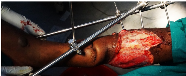
Fig. 7: Fracture covered with flap and exposed shin bone is seen.