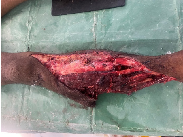
Fig. 6: Road traffic injury with fracture and exposed bone shaft.

split skin graft over the exposed bone and surrounding portion of the wound. The rest was covered with skin graft only. Later pseudomonas infection was encountered but managed successfully with bacteriophages and antibiotics. The wound healed in three weeks and later further orthopaedic management was done and a follow-up at five months was aesthetically pleasing(Figures 6, 7, 8, 9 and 10).