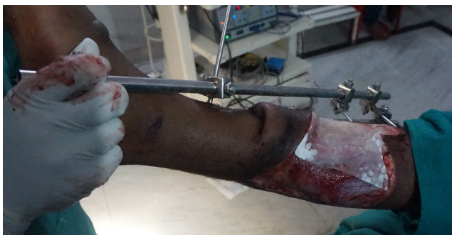
Fig. 8: MatriDerm applied