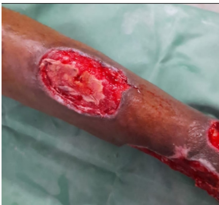
Fig. 2: Exposed tibia bone devoid of periosteum.