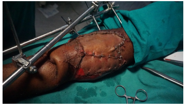
Fig. 9: Also added skin graft in single stage.