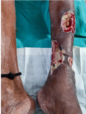
Fig. 1: A Patient wound

of the left ankle region with granulating soft tissue was also covered with a split skin graft of medium size. The dressing was done after seven days and a hundred per cent graft uptake was there. Proper diabetic control and sensitive antibiotics were continued. Wound dressings were repeated at 5 days intervals. The wound healed in three weeks' time and the follow-up at three months was aesthetically very pleasing (Figures 1, 2, 3, 4 and 5).