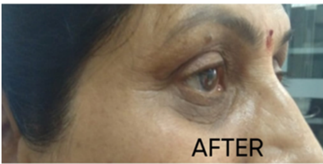
Figure 2: Before and after photo showing very good improvement on objective clinical assessment (score 3) after 3 months from baseline.