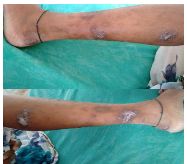
Fig. 2: Lesions healing with hyperpigmentation and atrophic scarring

Patient was started on 100 mg dapsone per day with considerable clearing up of cutaneous lesions within a couple of weeks' time and the patient was lost to follow-up after 2 months.