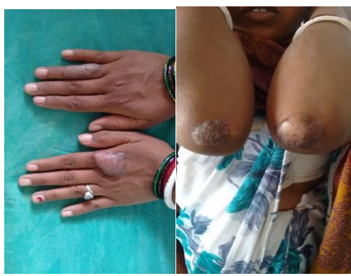
Fig. 1: Erythematous plaque on extensor aspect of first metacarpophalangeal joint of left hand and interphalangeal joint of right hand and both elbows