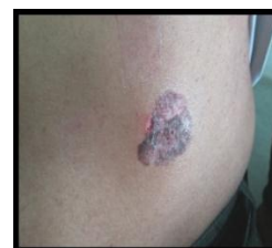
Fig. 2: Shows a single erythematous of about 3 cm x 3 cm in left lumbar region