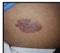
Fig. 1: Shows a solitary plaque over right thigh, erythematous, sharply-demarcated, dry, rough, scaly and crusted plaque approx. 3cm x 4 cm in size

Hyperkeratosis, parakeratosis, and upper dermis with moderate lymphocytic infiltrate. There was full thickness anaplasia of the epidermis and atypical keratinocytes which are disorderly arranged.