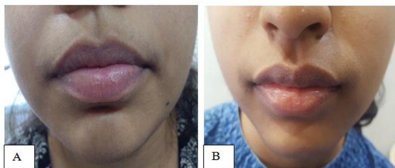
Fig. 1A: Upper lip and chin at first visit; Fig. 1B: Upper lip and chin at 6 th month with almost complete hair reduction