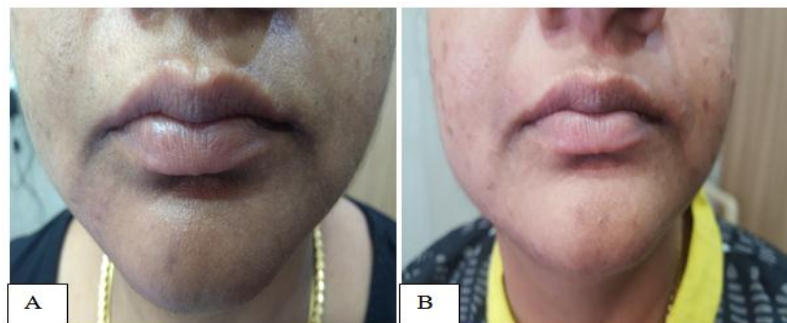
Fig. 2A: Upper lip at first visit; Fig. 2B: Upper lip at 6 th month with marked hair reduction