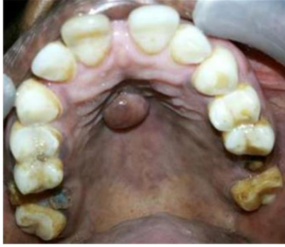
Fig. 3: Intra oral neurofibroma on the hard palate