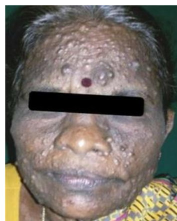
Fig. 1: Cutaneous fibromas on face with cafe-au-lait pigmentations

wavy form of shape and sharp corners, suggestive of neurofibroma [Fig. 4].