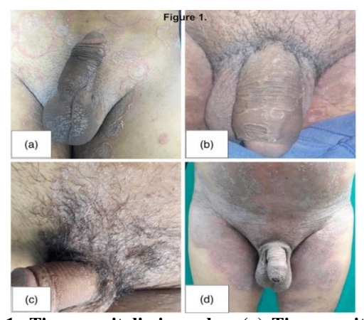
Fig. 1: Tinea genitalis in males: (a) Tinea genitalis involving scrotum, penis (dorsal and ventral aspects) and preputial skin with typical scaly annular lesions with central clearing in the groin; (b) Multiple annular scaly plaques over dorsal and ventral surfaces of penile shaft and scrotum; (c) Diffuse annular scaly plaque present in pubic region without central clearing and extending over scrotum and dorsal surface of penile shaft in a 29 years old male; (d) Extensive scaly thick plaques over abdomen, groin and penile shaft along with involvement of preputial skin and scrotum. This 40 year old patient prescribed intramuscular injections Triamcinolone acetonide and salicylic acid for topical application by a general practitioner

History of having used topical steroid was present in 202 (73.18%) patients (Fig. 5 a). Clinically, 238(86.23%) patients had lesions suggestive of having had topical steroid cream.