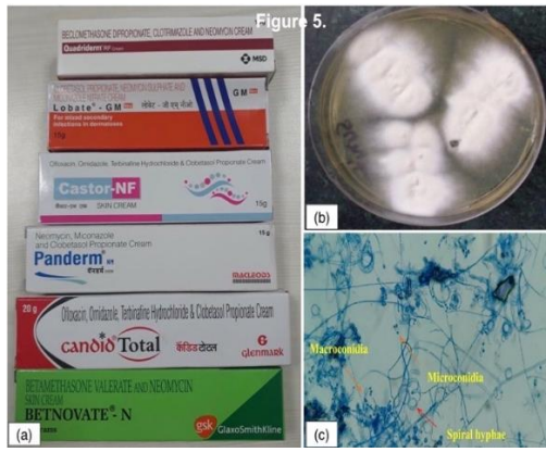
Fig. 5: (a) Various combinations of topical steroids, antifungal and antibacterial creams in irrational combinations sold as over-the-counter (OTC) creams; (b) Cottony beige coloured growth of T. interdigitale after one week incubation on SDA at 25°C; (c) Lacto Phenol Cotton Blue (LPCB) mount

A total of 271(98.188%) patients with tinea genitalis were KOH positive and 276 were culture positive. 274 (99.27%) cultures grew T. interdigitale and 2 (0.72%) T. rubrum .