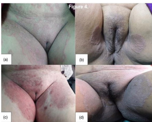
Fig. 4: Tinea genitalis in females: (a) Tinea genitalis and tinea cruris et corporis, annular erythematous scaly lesions with central clearing; (b) Tinea genitalis with bilateral annular plaques and involvement of labia majora without central clearing; (c) Erythematous scaly plaques over lower abdomen, mons pubis, thighs, groin and labia majora, atrophic skin at some places showing the long-term use of topical steroids; (d) Well-defined scaly plaques over mons pubis, labia majora, both thighs and groin