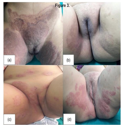
Fig. 3: Tinea genitalis in females: (a) Annular scaly plaques with double-edge, and atrophy of skin with history of use of topical steroids; (b) Healed hyper pigmented lesions. Patient got infection from her spouse; (c)24 years old female with annular erythematous scaly lesions on genitalia, also scattered on abdomen, got infection from her spouse; (d) Erythematous scaly plaques first appeared in medial sides of both thighs and buttocks and then spread to labia majora and mons pubis. Got infection from her partner