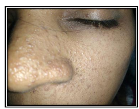
Fig. 1: Clinical picture showing angiofibroma