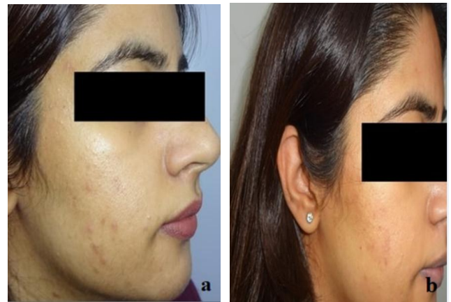
Fig. 2: Clinical improvement in acne scars following fractional CO<sub>2</sub> laser only group, showing: a) Ere treatment, b) Later treatment