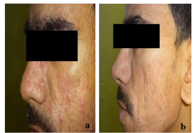
Fig. 5: Clinical improvement in acne scars following fractional CO_2 laser treatment with high- dose isotretinoin, showing: a) Ere treatment, b) Later treatment