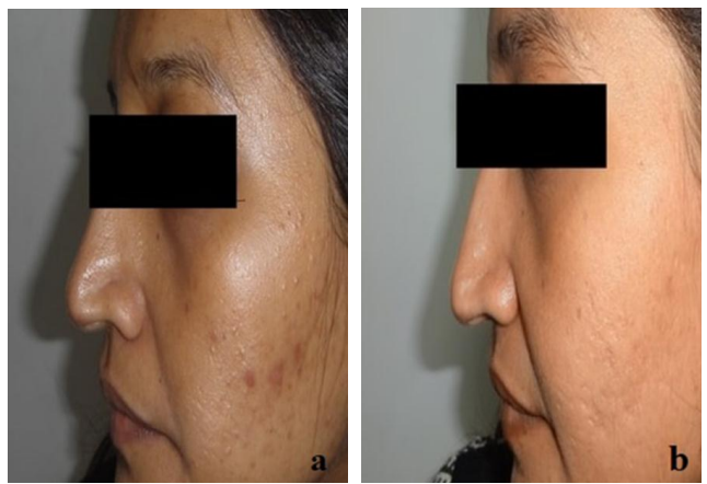
Fig. 3: Clinical improvement in acne scars following fractional CO<sub>2</sub> laser treatment with low- dose isotretinoin, showing: a) Ere treatment, b) Later treatment