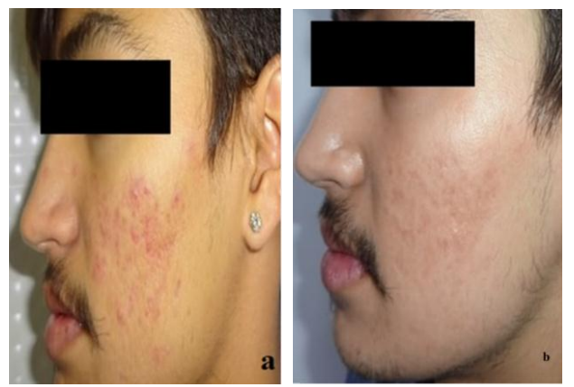
Fig. 4: Clinical improvement in acne scars following fractional CO_2 laser treatment with medium- dose isotretinoin, showing: a) Ere treatment, b) Later treatment