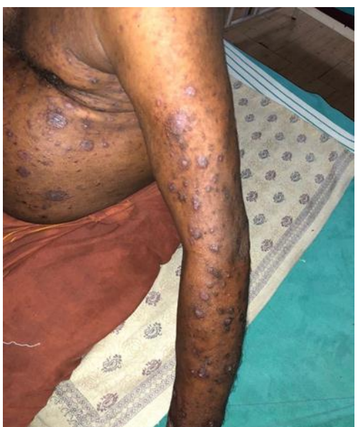
Fig. 5: Multiple erosions and raw areas with few pustules (distal forearm) over the violaceous plaques present on abdomen and right upper limb.