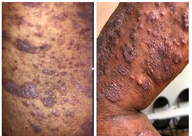
Fig. 3,4: Multiple vesicles and bullae present adjacent to violaceous plaques.