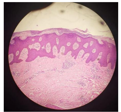
Fig. 7: Photomicrograph showing acanthosis, parakeratosis with elongated club shaped rete ridges and supra papillary thinning (H&E stain, \times 10 ).

Based on clinical features, morphology of lesions and histoimmunological studies, a final diagnosis of lichen planus pemphigoides was made. Hence the treatment with oral prednisolone (30mg/day) along with topical application of potassium permanganate solution over lesions thrice daily (Condy's crystals mix with warm water in ratio of 1:10000) was initiated. Lesions started resolving as the induration and scaling started reducing without emergence of new lesion. Blisters also started resolving with symptomatic improvement of the patient. Therefore, the dose of prednisolone was tapered gradually (20mg/day). After two days, patient developed multiple erythematous papule and plaques over bilateral legs and trunk with scaling. Skin biopsy from scaly papule showed acanthosis, parakeratosis with elongated club shaped rete ridges and supra papillary thinning (Fig.7). Hence reoccurrence of psoriasis vulgaris was confirmed. Oral prednisolone was stopped after tapering