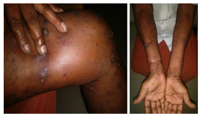
Fig. 1,2: Multiple dark color lesions over thigh (Fig. 1) and both upper limb (Fig. 2).

A 66yr old male patient presented with complaints of multiple dark coloured raised lesions over scalp since past 4 years which was insidious in onset and progressive in nature initially on scalp and gradually progressed to all over the body associated with itching. This is followed by appearance of clear fluid filled lesions over the pre existing raise lesions and over the normal skin (Fig. 1,2.) from past 20 days. The lesions were progressive and associated with moderete to severe pruritis. He was known case of psoriasis vulgaris from past 11 years and was on irregular treatment for same (topical corticosteroids for variable period, T. Methotrexate 7.5mg weekly 5-10 weeks multiple times and narrow band phototherapy - details unknown). He also had complaints of joint pain with waxing and waning history. Joint pain is not associated with localised swelling/morning or evening stiffness. History of photosensitivity is present over scalp, bilateral upper limbs and upper back. There was no history of oral ulcers or dental pathology. History of Drug intake prior to onset of initial lesions was not present. No history of pus filled lesions and fever. No associated comorbidities were present.