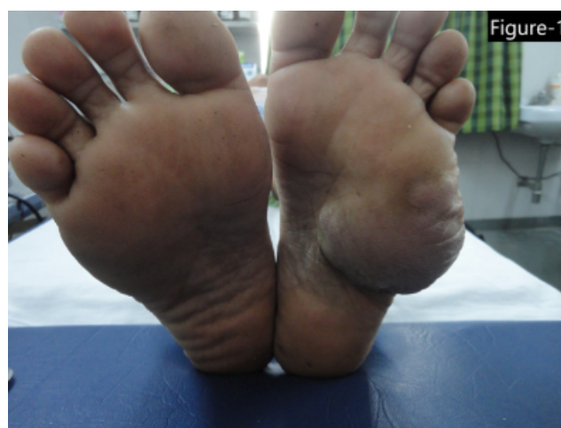
Fig. 1: Single, soft, elongated, non-tender swelling of size 6*4 cm over the sole of left foot.

Neurofibromatosis (NF), one of the most common genetic disorders is inherited in an autosomal dominant fashion. It is classified into genetically distinct subtypes NF1 and NF2, characterized by multiple cutaneous lesions and tumours of the peripheral and central nervous system. 1 NF type 1, the most common type of NF, is a multisystem disorder which accounts for about 90% of all cases and affects approximately 1 in 3500 people. 2 It presents with a myriad of cutaneous and non-cutaneous manifestations ranging from café au lait macules to disfiguring plexiform neurofibromas. The latter develop near nerve roots deep within the body and have a tendency to expand along large segments of affected nerves, causing disfigurement and nerve dysfunction and bearing a 10% probability of malignant transformation. They usually involve areas along the trigeminal nerve distribution, but we present two NF type 1 cases with presence of plexiform neurofibroma at atypical sites such as sole and forearm.