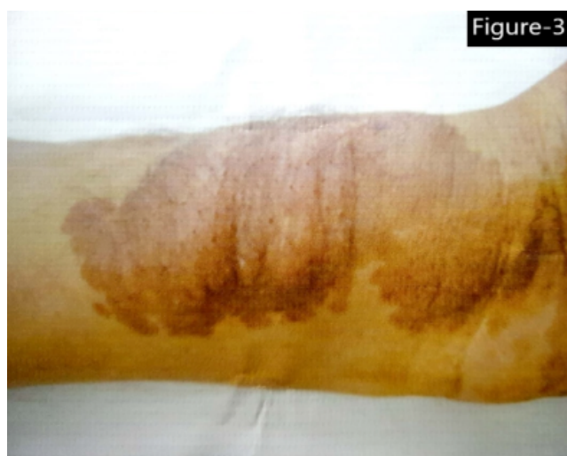
Fig. 3: Single, large, soft, elongated, non-tender swelling of size 10*5 cm over a pre-existing café-au- lait spot on ventral aspect of left forearm near the wrist

café-au-lait: spots since childhood. Ocular examination showed lisch nodules. No other systemic abnormalities were found. Family history was negative. No history of consanguineous marriage. Routine investigations, USG of local part and CT scan were normal. The swelling was excised by a surgeon and histopathological examination was done, keeping the differentials as neurofibromatosis, lymphangioma, lipohemangioma. It showed interlacing bundles of elongated cells with wavy, darkly stained nuclei with cells were arranged in short fascicles at some places. The stroma showed wire-like strands of collagen (shredded carrots), areas of myxoid changes and vascular proliferation