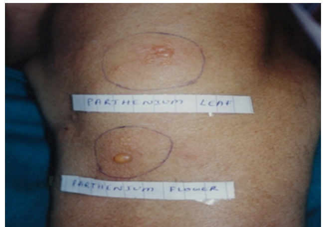
Fig. 2: Parthenium Leaf and Flower