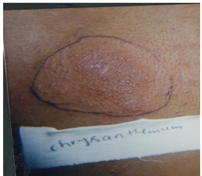
Fig. 3: Chrysanthemum