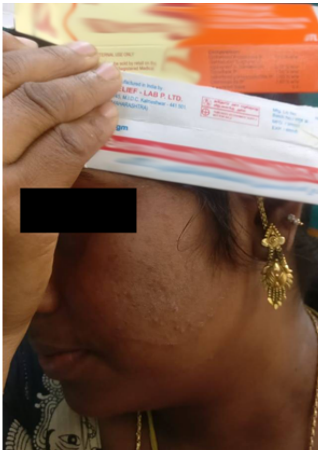
Fig. 2: Tinea faciei