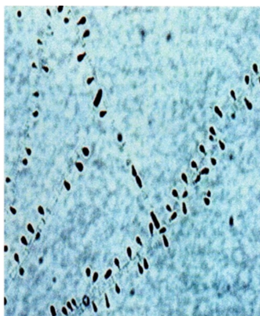
Fig. 7: Trichophyton rubrum

There is a rising epidemic of superficial fungal infections in India. Dermatophyte infection is more common in India due to hot and humid climate, low hygiene, poor access to water, overcrowding, high interpersonal contact. Dermatophyte infection become resistant and difficult to treat because of the rising trend of misuse of potent topical steroids by