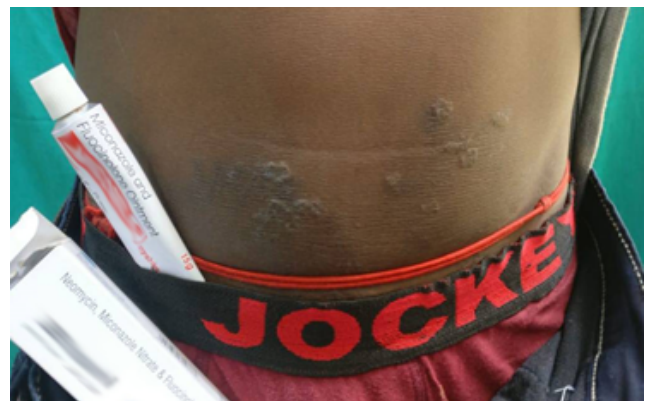
Fig. 4: Tinea corporis