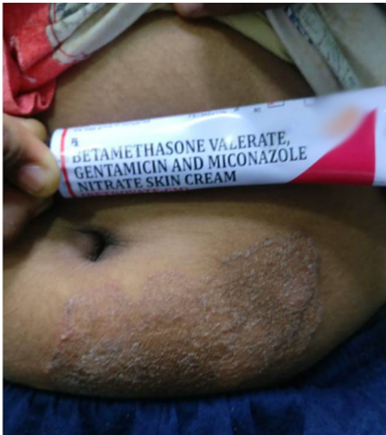
Fig. 1: Tinea Corporis