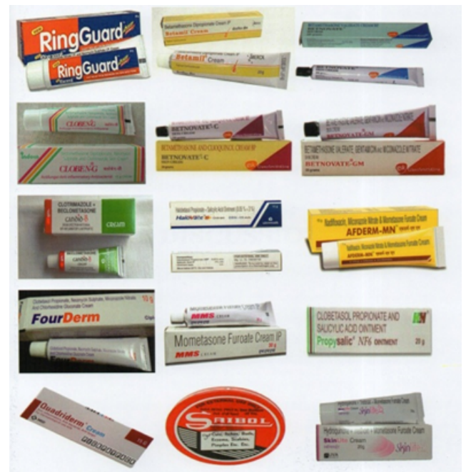
Fig. 5: List of Irrational combination of topical corticosteroid containing preparations

Table 8 Shows that clobetasol propionate 0.05% was the most commonly abused steroid in 25 patients(45.45%) which was used for 0-1 month in 13 patients(48.1%) on an twice daily basis in 7 patients(63.63%) causes most common side effect of Tinea Incognita in 12 patients(36.36%), followed by Betamethasone valerate 0.1% in 17 patients(30.9%) which was used for 0-1 month in 7 patients(36.8%) on an intermittent basis in 7 patients(36.8%) causes most common side effect of Tinea Incognita in 14 patients(25.45%).