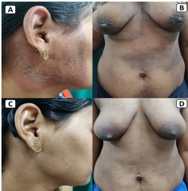
Fig. 3: A, B- Extensive Tinea Corporis et faciei with irritant contact dermatitis; C, D- Complete clearance of lesions in patient with multiple site involvement after 1 month of treatment