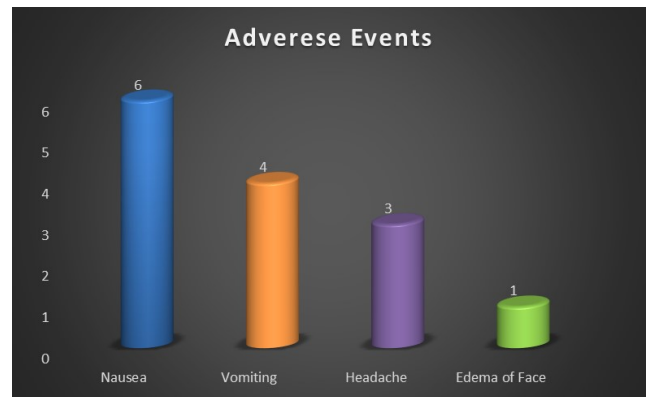
Fig. 6: Adverse events reported by the patients

1). All the AEs were mild in nature, appeared during initial 2 weeks of therapy and resolved during study, none of the patient discontinued the therapy because of AEs. (Figure 6)