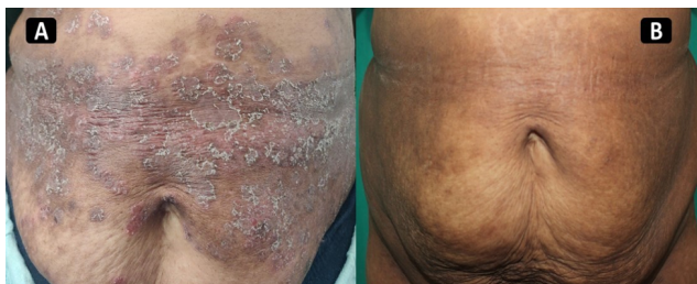
Fig. 4: A- Patient with Tinea Incognito; B- Good clearance of the lesions at end of 1 month

clinical cure (Figure 2). There was improvement in each symptom during study duration as observed during each follow up visit on week 2, 4 and 6. Mean baseline erythema score was 2.76 \pm 0.62 at the start of study which was significantly decreased to 0.13 \pm 0.33 ( p < 0.0001 ) after 6 weeks. There was significant improvement in scaling of the patients from baseline at the end of therapy ( 2.55 \pm 0.73 vs. 0.23 \pm 0.55 ; p < 0.0001 ). Similarly, there was significant decrease in pruritus ( 3.61 \pm 0.52 vs. 0.34 \pm 0.66 ; p < 0.0001 ) and incrustation ( 1.1 \pm 0.81 vs. 0.08 \pm 0.28 ; p < 0.0001 ) from baseline at the end of therapy. (Figure 5)