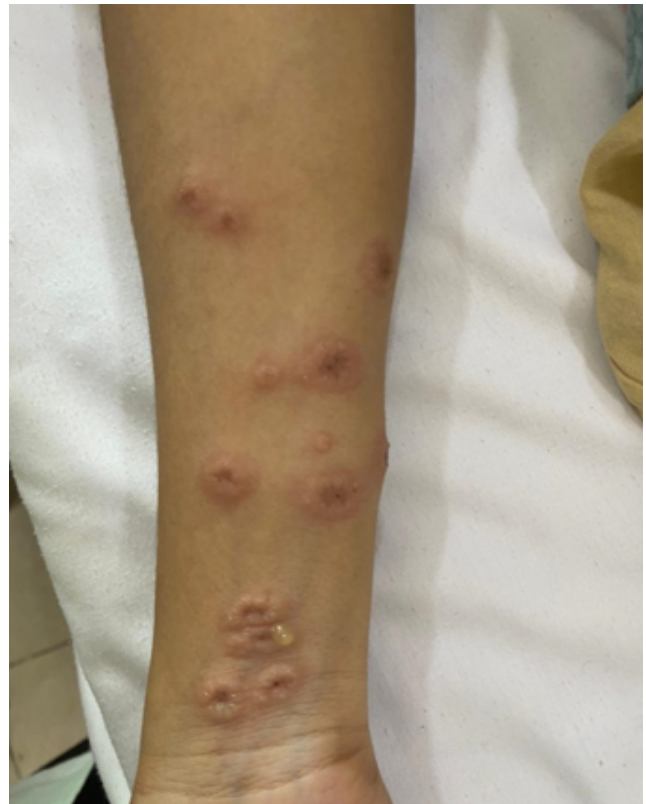
Fig. 3: Erythematous annular plaques with vesicles at day 3 overvolar aspect of forearm

The prednisolone dose was then increased to 40mg once daily, and first generation antihistamine, oral