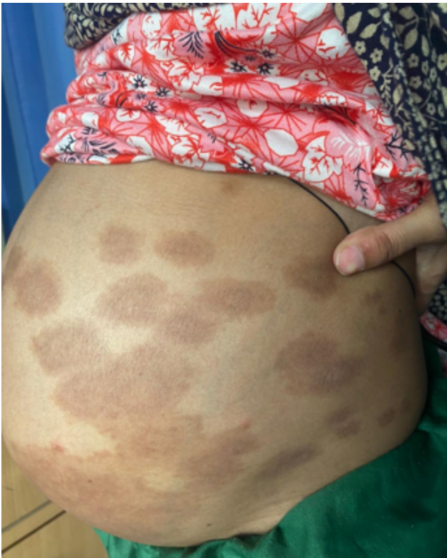
Fig. 5: Marked improvement in lesions seen after oral prednisolone (40mg)

chlorpheniramine maleate 4mg thrice daily was added to the treatment.