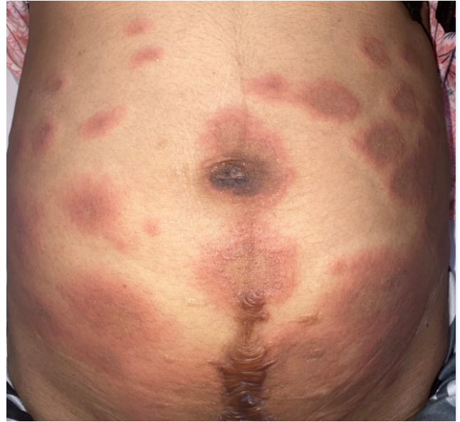
Fig. 2: Enlargement of lesions after 3 days

Patient was initially started on oral Prednisolone 30mg once daily, levocertizine 5mg twice daily with topical mometasone furoate 0.1% to be applied twice daily over the lesions. After 5 days of follow-up, patient presented with an increase in size and no. of lesions, with increase in severity of pruritis.(Figures 2 and 3)