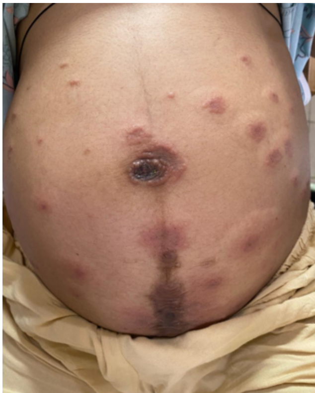
Fig. 1: Erythematous annular plaques with periumbilical involvement at the time of first presentation