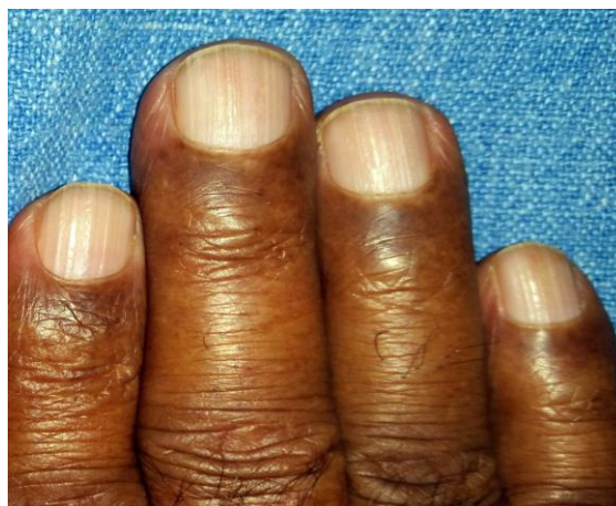
Fig. 3: Onychorrhexis