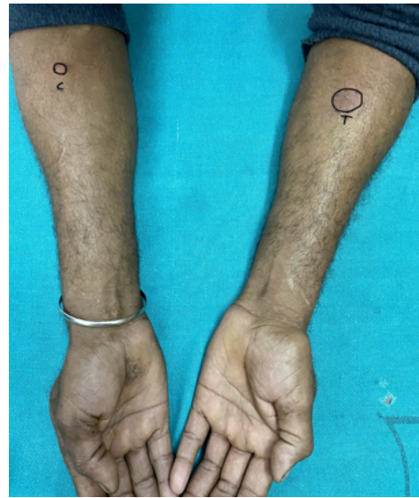
Fig. 3: Image of a patient with a positive ASST.

ASST was positive in 26 (44.8%) out of 58 patients and negative in 32 (55.2%). On comparing various clinical and epidemiological factors with ASST test, it was found that age and gender distribution was comparable in both ASST positive and ASST negative patients and there was no statistical difference. Similarly, age of onset of the disease did not vary significantly between the two groups. Patients who were ASST positive showed a higher mean duration of the disease (1.5 ±0.9 years) than the test negative group (1.0 ± 0.6 years), however the difference did not reach the level of statistical significance.