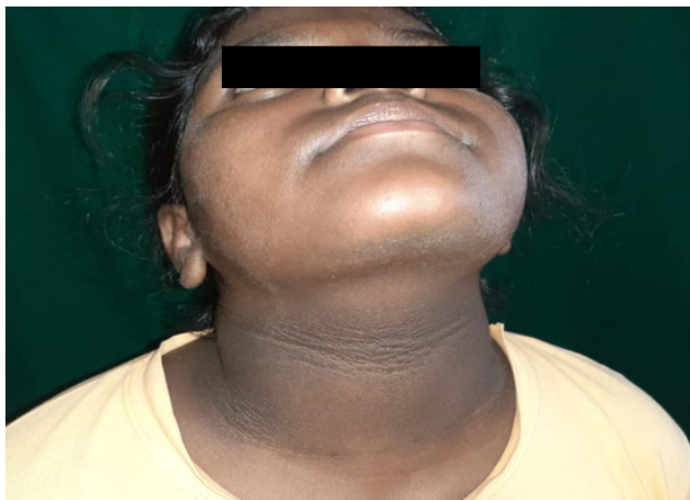
Fig. 6: Neck texture 3 [extremely coarse: “hills and valleys” observable on visual examination]

fasting serum insulin levels ( p < 0.00001 ) and HOMA-IR ( p = 0.00001 ), which was statistically significant.