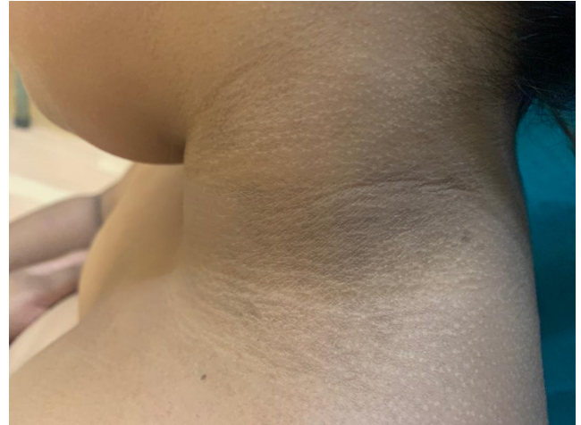
Fig. 4: Neck texture 1 [rough to touch: clearly differentiated from normal skin]