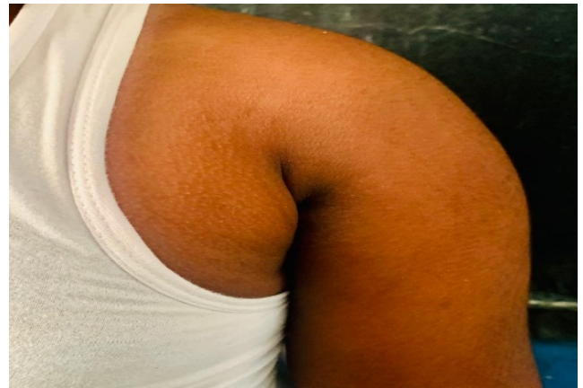
Fig. 10: Axilla severity 4 [acanthosis nigricans visible from front in the unclothed participant when the arm is adducted].

hyperinsulinemia and development of diabetes mellitus. Hence, acanthosis nigricans is aptly a marker of insulin resistance and hyperinsulinemia, with or without diabetes mellitus.