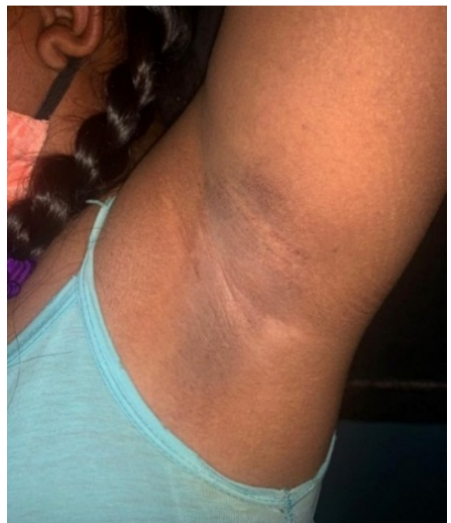
Fig. 7: Axilla severity 2 [acanthosis nigricans localized to the central portion of the axilla, may have gone unnoticed by the participant]

Acanthosis nigricans is characterized by hyperpigmentation and velvet like thickening of skin. It is seen symmetrically involving the neck, axilla, groins, antecubital and popliteal fossae, umbilical, perianal areas and in advanced conditions, even dorsum of hands and fingers. It is strongly associated with obesity, which in turn is accompanied by