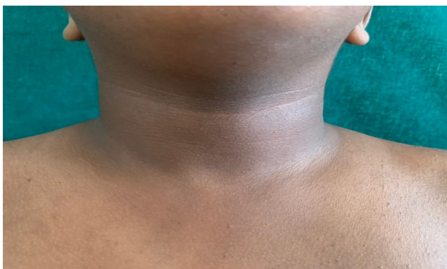
Fig. 3: Neck severity 4 [acanthosis nigricans extending anteriorly (>6 inches), visible when the participant is viewed from the front]