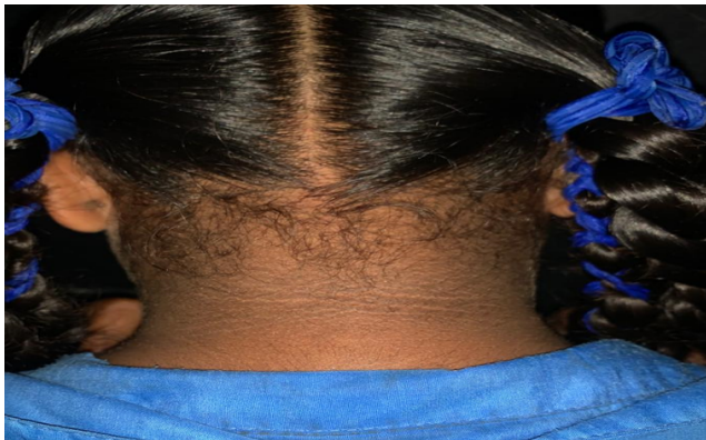
Fig. 2: Neck severity 3 [acanthosis nigricans extending to the lateral margins of the neck (posterior border of the sternocleidomastoid) (usually 3-6 inches), should not be visible when the participant is viewed from the front]