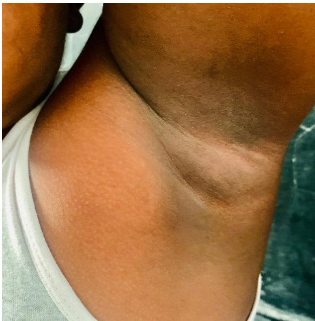
Fig. 9: Axilla severity 4 [acanthosis nigricans involving entire axilla and extending to front and back]