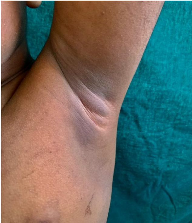
Fig. 8: Axilla severity 3 [acanthosis nigricans involving the entire axillary fossa, but not visible when the arm is against the participant's side]