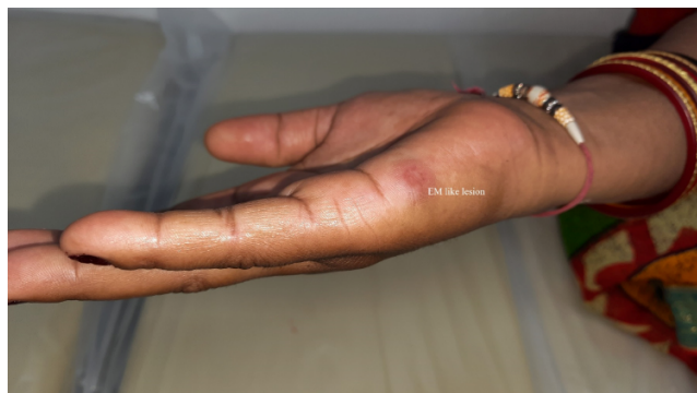
Fig. 1: Erythemamultiforme like lesion on palm

biopsy was deferred. The skin eruption resolved with short course of oral prednisolone 20mg for 5 days along with topical emollients and oral antihistamines.