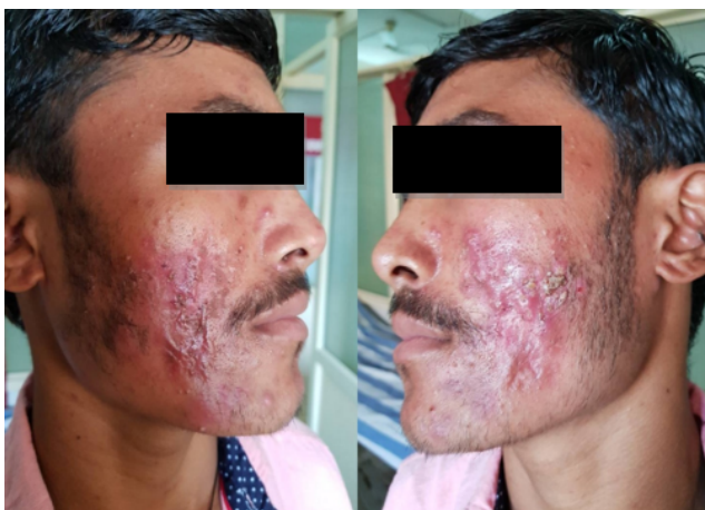
Fig. 3: Nodulocystic acne with very large effect DLQI & medium CADI