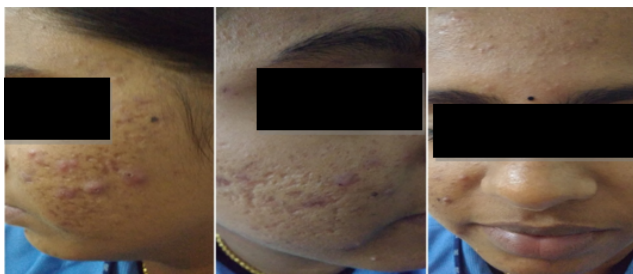
Fig. 2: Nodules, papules over the cheeks and comedones and papules over the forehead with low effect CADI & small effect DLQI