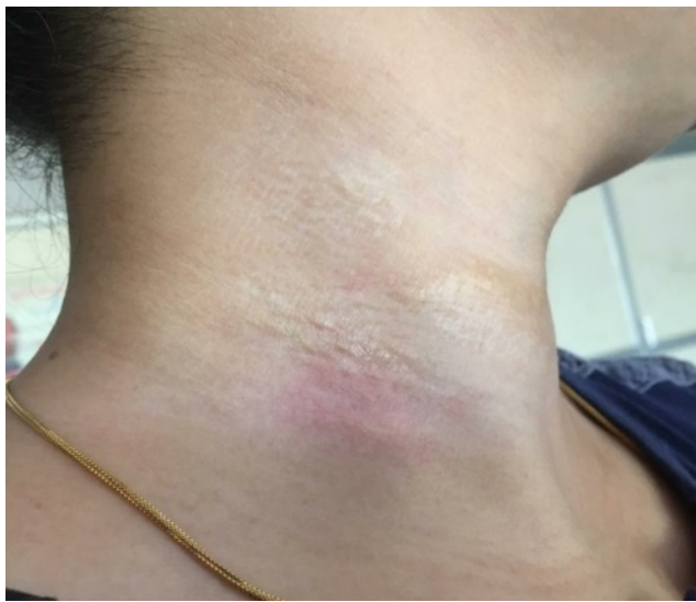
Fig. 1: Yellow-orange papules over neck