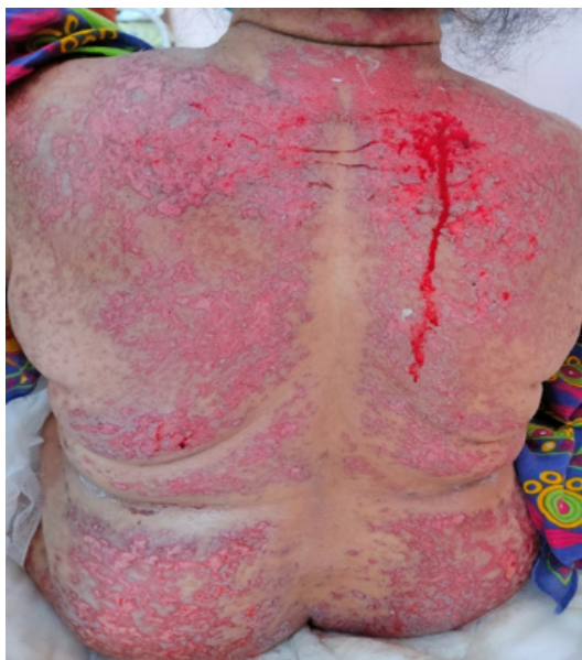
Figure 2: Ulceration over psoriatic plaques.