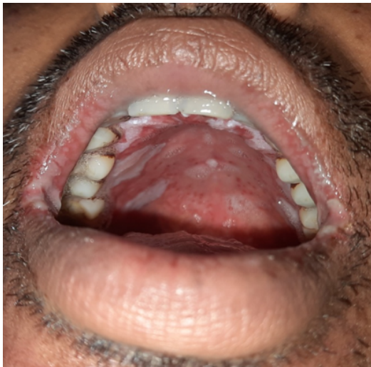
Figure 1: Multiple ulcers present in oral cavity

from 38-70 years with mean age of 64 years. 7 cases had both oral and cutaneous involvement, 4 had genital mucosa involvement, while only oral ulceration was present in 2 cases. Organ specific toxicities were observed in our case series. 7 patients had cutaneous toxicity. Pancytopenia and mucositis were seen in all cases, while hepatotoxicity and acute renal failure in 3 cases. Demographic details, clinical manifestations, Skin and mucosa findings, various reasons for overdosing, acute cumulative dose resulting in toxicity and duration to achieve acute toxic cumulative dose of all cases have been illustrated in Table 1. Systemic complications, risk factors and outcome of the cases have been described in Table 2.