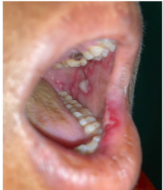
Figure 3: Multiple erosion presents over buccal mucosa.