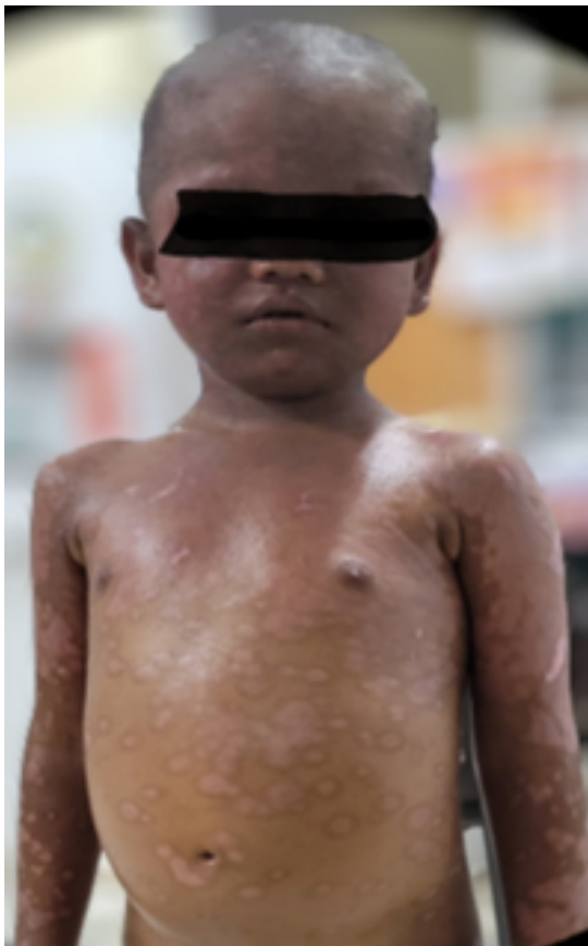
Figure 4: Completed recovery of Lamotrigine induced TEN on day 10 reveal post inflammatory pigmentary changes.

dysregulation, infections, vaccination, active malignancy rarely cause TEN in genetically predisposed individuals. 4 Median duration for LTG causing TEN is 17 days and dosage is 50 mg for SJS and 87.5 mg for TEN. Lamotrigine toxicity occurs with 16 g/ day dose, develop seizures, coma, conduction abnormalities and death. Combining LTG with Valproic acid (VPA) causes SJS in 74% and TEN in 64% cases. The exact mechanism was poorly understood. Monotherapy with LTG, almost 55% bound to plasma proteins will be in circulation for 25–30 hours. VPA inhibits LTG glucuronidation, impair LTG clearance and increase the half-life of LTG to 60 hours. Arene oxide is a LTG metabolite (minor cytochrome P450 enzyme pathway), is toxic to nucleic acids, DNA, and RNA, leading to cellular damage in TEN. VPA further inhibits arene oxide detoxification by microsomal epoxide hydrolase (EPHX) and/or GSH-S-transferases and deplete glutathione levels. 5,6