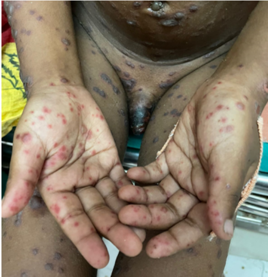
Figure 3: Targetoid lesions of TEN appearing over palms and soles on Day 5 illness