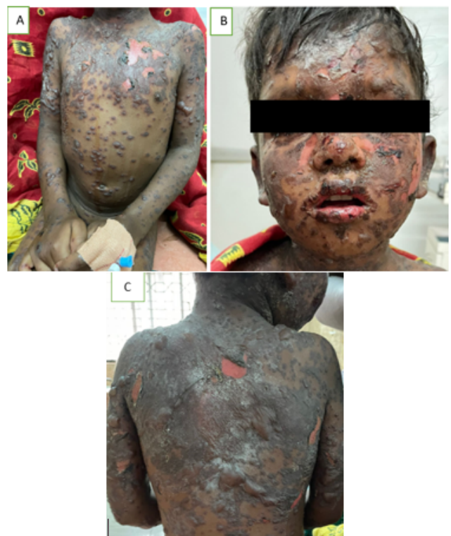
Figure 2: A: TEN lesions on day 5 reveal extensive necrotic blisters with exfoliation affecting upper trunk and arms; B: Severe TEN lesions affecting face, lips and conjunctiva on day 5; C: Extensive TEN lesions, manifested as large hemorrhagic blisters and erosions on day 5 of illness.