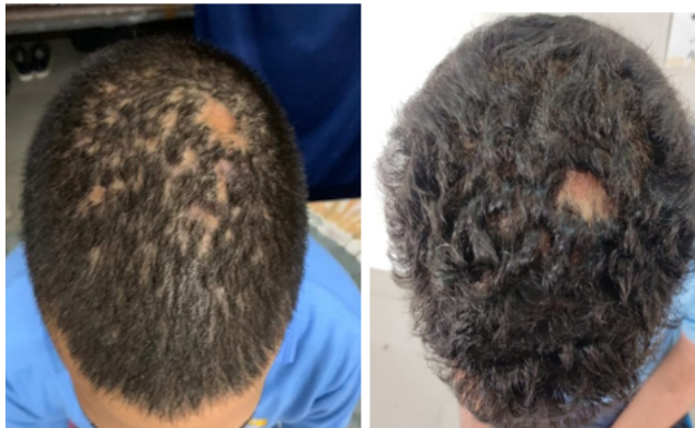
Figure 2: Pre-treatment post-treatment, Before and after 6 sessiond of PRP