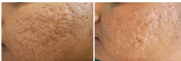
Figure 3: Pre-treatment, Post-treatment, Before and after 6 sessions of PRP