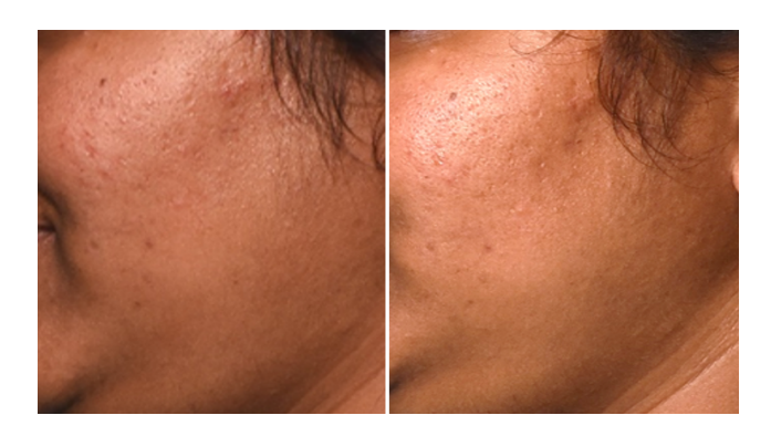
Figure 6: Case 13: Mangalore female sample aged 35, left photo taken before and the right taken after the YPV facial session. Pores and pimples on the cheeks were reduced by more than 50%, and a glow appeared.