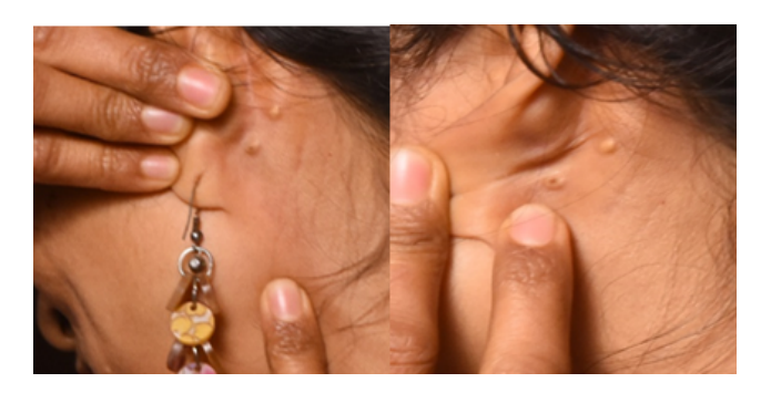
Figure 3: Case 10: Before and after

For this study, the data presented are photographs of 11 participants of the Pune workshop taken as examples before and after the intervention, and participant feedback at the end of the event. These 11 cases are explained in detail in Table 3.