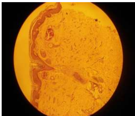
Fig. 2: Convoluted and cystic structures with some epithelial cords with comma-like tails in fibrous stroma (H&E, 10x10)