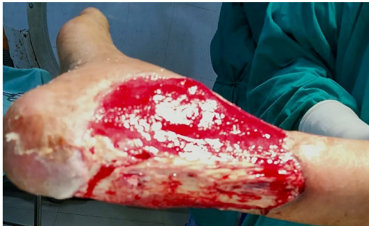
Figure 4: Post VAC and MatriDerm application.

Continuous monitoring ensures the formation of an ideal granulation tissue bed crucial for successful skin grafting in the final second stage (Figure 4).