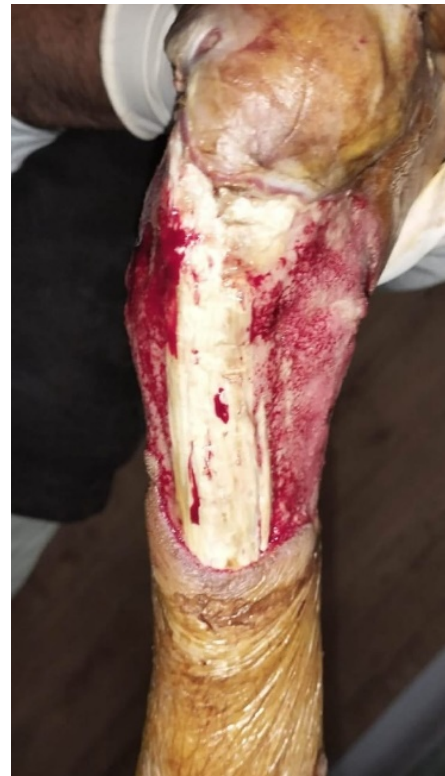
Figure 1: Exposed tendoachilles tendon with longitudinal slices given.

The Achilles tendon is intentionally longitudinally split at multiple sites randomly to create a conducive environment for granulation tissue formation and efficient wound healing (Figure 1).