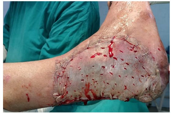
Figure 5: SSG

Following skin grafting, the wound is dressed with sofratulle and over it saline soaked moist cotton gauze pieces followed by bandaging. The patient undergoes first dressing after 7