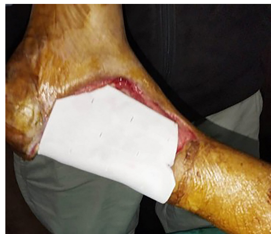
Figure 2: MatriDerm applied

Matriderm, a dermal bovine collagen matrix, is applied to the split Achilles tendon to provide a scaffold for cell ingrowth and neovascularization, fostering an environment conducive to tissue regeneration (Figure 2).