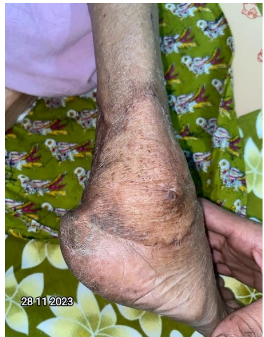
Figure 6: Follow-up 10 months

Preliminary results demonstrate successful wound closure, minimal complications, and an optimized healing trajectory. Follow up after one year was excellent. There is no scarring or contracture development. The skin is pliable and elastic and free of underlying tendon surface and easily mobile with wrinkles of elastic skin can be observed. The skin can be freely pinched with forceps and sensation subjectively is almost normal to the surrounding skin sensation. It is aesthetically more appealing (Figures 6 and 7 a & b).