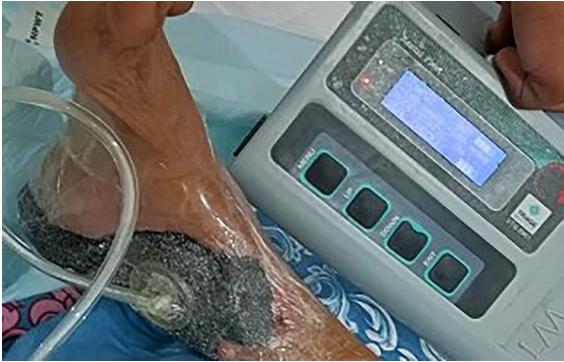
Figure 3: VAC applied

Sub atmospheric negative pressure (at minus 125 mm of mercury) wound therapy (VAC) is employed to remove excess fluid, reduce oedema, and enhance blood flow, thereby promoting quicker formation of granulation tissue helping optimal wound healing (Figure 3).