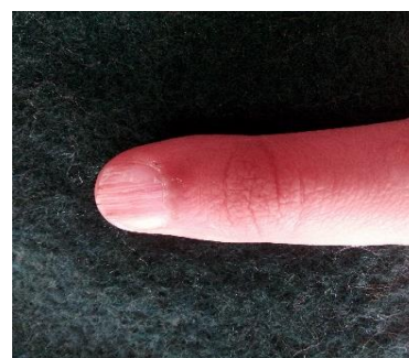
Fig. 3: Improvement following six months of treatment

Nail biopsy was refused. Besides, the diagnosis of LS is usually based on the presence of typical skin lesions. (4) A Diagnosis of LS with nail dystrophy was made and the child was started on topical tacrolimus 0.1% ointment. A considerable improvement was observed in the six month follow up period (Fig. 3).