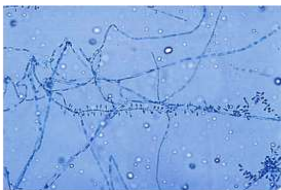
Fig. 5: Lactophenol cotton blue mount showing microconidia of Trichophyton rubrum