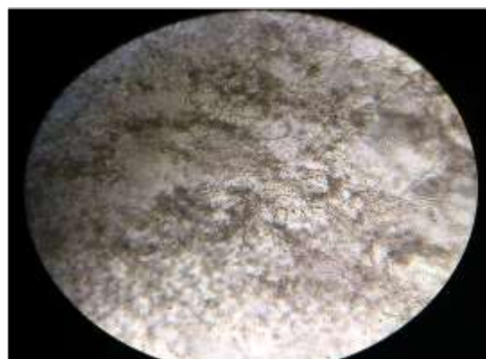
Fig. 2: KOH positive shows branched hyphae