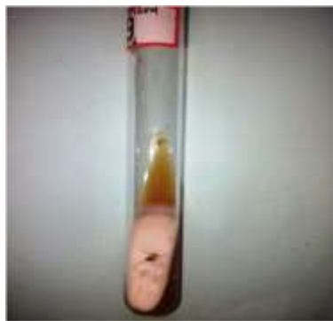
Fig. 3: Dermatophyte Test media shows positive culture of microsporum species