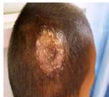
Fig. 1: Kerion- Inflammatory boggy swelling with pustules