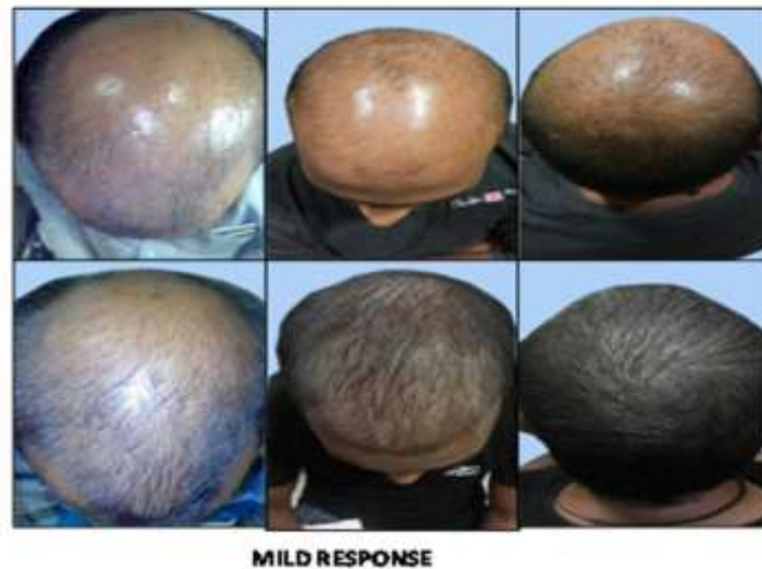
Fig. 3: Mild response at the end of 6 months