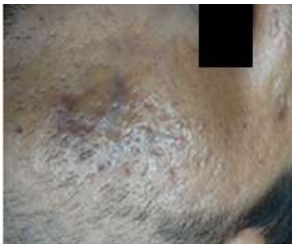
Fig. 4: Pigmentary changes in dermabrasion

Pigmentary changes were seen in almost all the patients. Pigmentary disturbances more commonly seen in dermabrasion, as noted by the p value which is significant (Fig. 4).