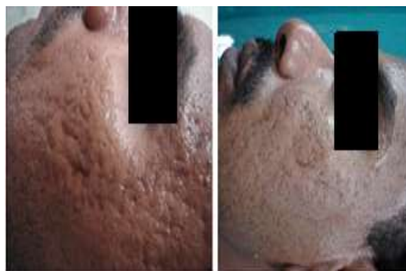
Fig. 3a and 3b: Pre and Post Images of Dermabrasion (Grade 2)

Group B – Dermabrasion: Among the 15 patients in group B who underwent dermabrasion, at the end of 4 sessions, 3 patients showed less than 25% improvement. 7 patients showed improvement between 25-49%. 3 patients showed an improvement of 50-74% in their acne scars (Fig. 3a and b). 2 patients showed an improvement of more than 75%.