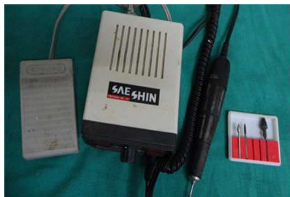
Fig. 1: Dermabrader

Instruments: Electrical dermabrader or hand engine 10,000 – 25000 rpm. Diamond fraizes Wire brushes and electrical/ motor dermabrader (Fig. 1)