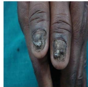
Proximal subungual onychomycosis Total dystrophic subungual onychomycosis Fig. 1: (PSO &TDO)