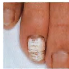
Distal and lateral subungual onychomycosis Superficial white onychomycosis Fig. 2: (DLSO & SWO)

The fungal pathogens identified by culture as shown in the Fig. 3.