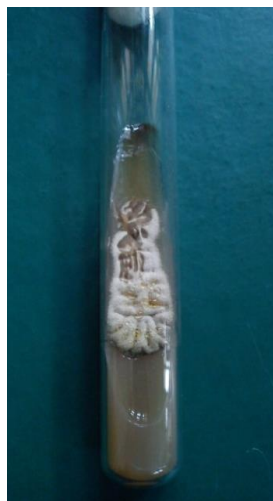
Fig. 4: Candida growth