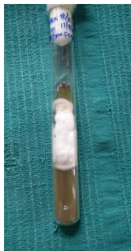
Fig. 5: T.rubrum growth