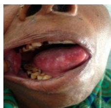
Fig. 4b: Erosive lesions on lateral aspect of tongue

In the present study, two patients with psoriasis showed fissured tongue (Fig. 5) which are already reported in few other studies. 16 Even though strong correlation suggested, these lesions are not pathognomonic feature of the disease.