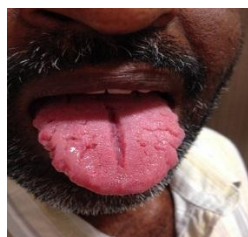
Fig 5: A psoriasis case presented with fissured tongue

In the present study, two patients with psoriasis showed fissured tongue (Fig. 5) which are already reported in few other studies. 16 Even though strong correlation suggested, these lesions are not pathognomonic feature of the disease.