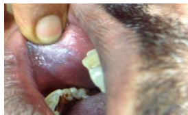
Fig. 3: Reticular lichen planus on buccal mucosa

observed in 10 patients (7.7%), with commonly seen clinical type as reticular type (70%), (Fig. 3) followed by atrophic type(20%) and erosive – ulcerative type(10%). This was in consistent to other study. 13 Four cases showed concomitant skin and nail changes.