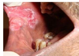
Fig. 2: Ulceroproliferative squamous cell carcinoma on buccal mucosa

Buccal mucosa was the commonest site of involvement (Fig. 2) in the present study population (85%) which was in consistent with other study. 12 This finding can be attributed to the oral risk habits of chewing betel quid and tobacco.