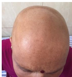
Fig. 2: Diffuse alopecia secondary to Cisplatin

Among the 50 patients studied, 40 patients showed hair changes, in the form of alopecia affecting the scalp. All patients had scalp involvement and 18 cases (36%) had involvement of other sites. Out of the 40 cases 34 (85%) presented with grade 2 and 6 (15%) with grade 1 alopecia. In majority of the cases (85%) the onset was within 4-5 weeks of initiation of therapy. The hair changes observed have been tabulated in Table-1. Anagen effluvium was seen in 37 (74%) patients and telogen effluvium in 6 (12%) patients (Fig. 1, 2)