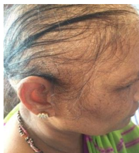
Fig. 1: Anagen effluvium secondary to 5-Fluorouracil