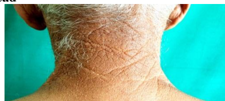
Fig. 2: Shows deep furrowing of the skin at the nape of the neck, with intersecting skin folds resulting in rhomboidal configurations which gives appearance of 'cutis rhomboidalis nuche'