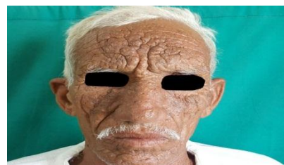
Fig. 1: Shows The skin of forehead, zygomatic and malar areas of face is atrophic, inelastic and showed deep wrinkles with multiple comedones, yellowish colored papules and nodules over cheeks and forehead

cosmetics or medical creams to the face. He had been smoking more than 20 cigarettes a day for the past 4 decades. The patient was emotionally disturbed with the ugly appearance of his face. On histological examination, epidermis shows epidermal cyst formation containing laminated keratin and superficial dermis shows follicular infundibular plugging with large nodules filled with keratinous material. Overall features correlates with the findings of Favre Racouchot syndrome and final diagnosis was made.