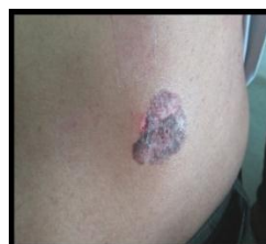
Fig. 2: Shows a single erythematous of about 3 cm x 3 cm in left lumbar region