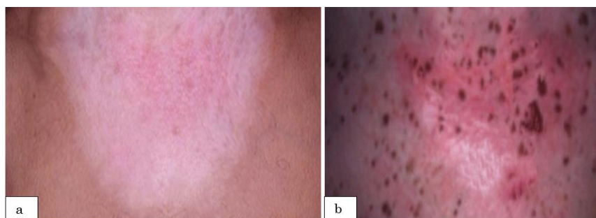
Fig. 3: Effect of PUVA therapy before and after treatment; (a): Before treatment), (b): After treatment