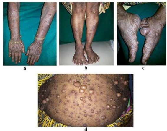
Fig. 2: Cutaneous fibromas on hands (a), legs (b, c) and trunk (d)