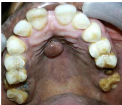
Fig. 3: Intra oral neurofibroma on the hard palate