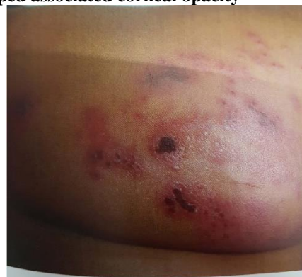
Fig. 4: Involvement of Sacral 2 and 3 ganglions in a HIV positive patient