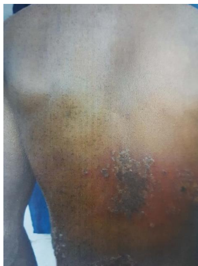
Fig. 2: Shows multidermatomal herpes zoster in a 45 year old male patient with herpes zoster having bilateral involvement