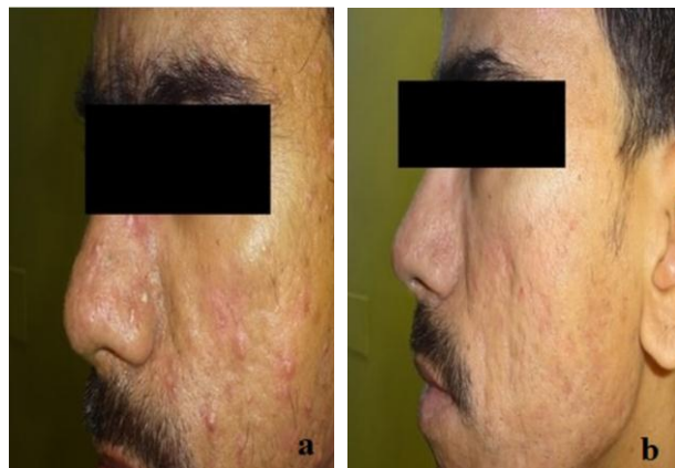
Fig. 5: Clinical improvement in acne scars following fractional CO 2 laser treatment with high-dose isotretinoin, showing: a) Ere treatment, b) Later treatment