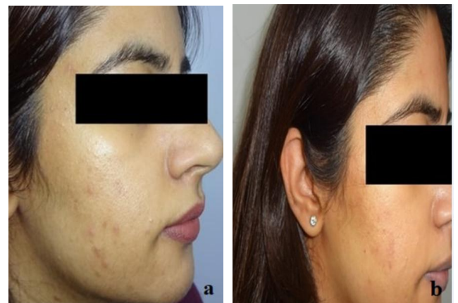
Fig. 2: Clinical improvement in acne scars following fractional CO 2 laser only group, showing: a) Ere treatment, b) Later treatment