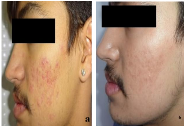
Fig. 4: Clinical improvement in acne scars following fractional CO 2 laser treatment with medium-dose isotretinoin, showing: a) Ere treatment, b) Later treatment