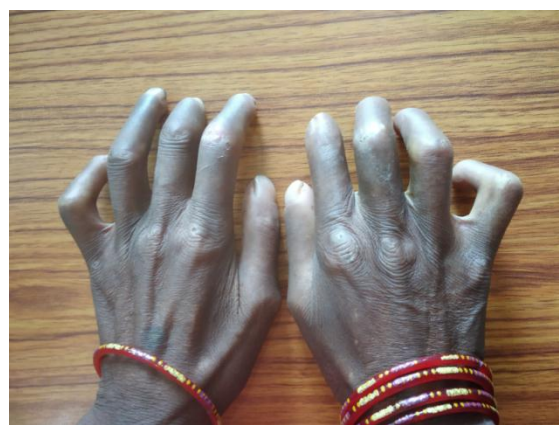
Fig. 4: Sclerodactyly in a case of diffuse cutaneous systemic sclerosis.