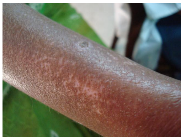
Fig. 3: Salt and pepper pigmentation in a case of diffuse cutaneous systemic sclerosis.