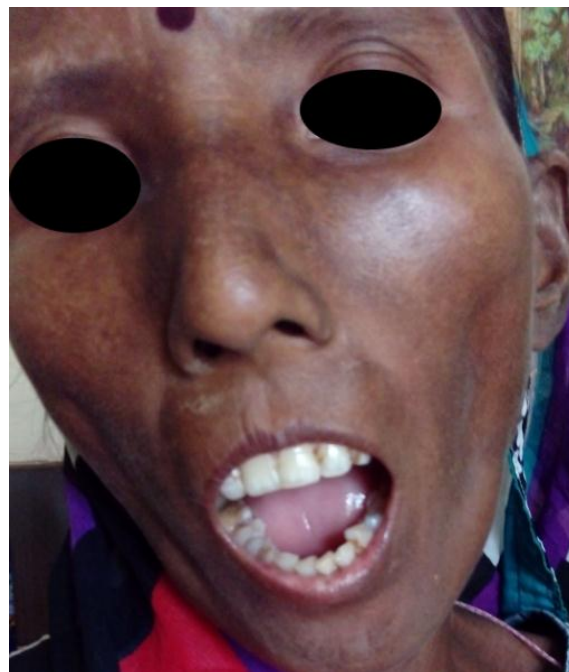
Fig. 2: Microstomia and pinched nose in a case of diffuse cutaneous systemic sclerosis.