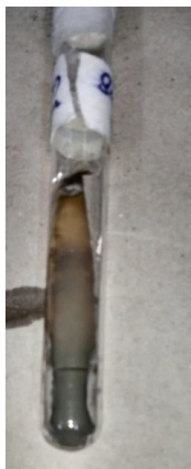
Fig. 5: Fungal growth seen after 3 weeks of culture.