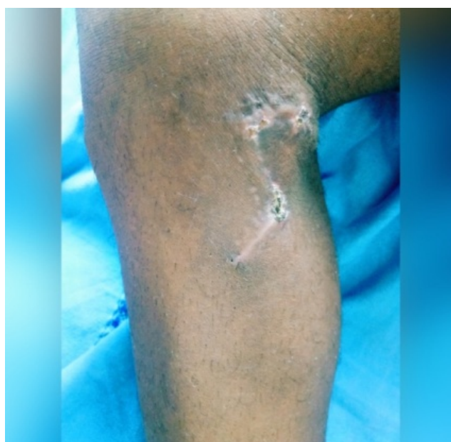
Fig. 3: Excision biopsy done over right knee region

Aureobasidium pullulans is the most common etiological agent of human disease. Most common route of infection is through traumatic inoculation. Most common presentation is ulcerative nodules with disseminated systemic infection. Diagnosis is confirmed by skin biopsy and culture.