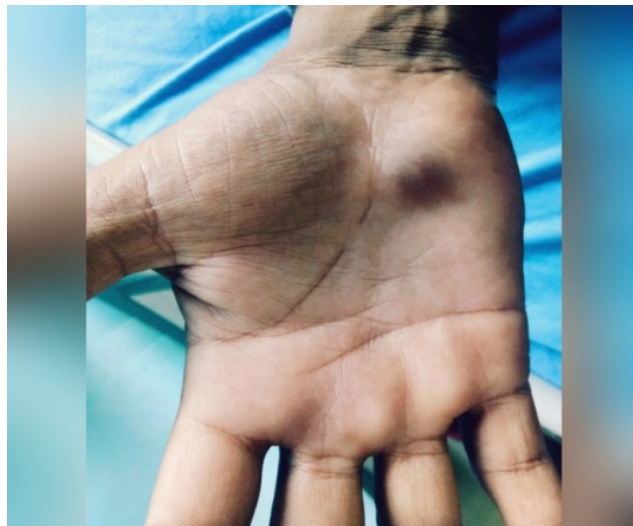
Fig. 2: Lesion after 3 months of voriconazole therapy

These are saprophytic dematiaceous fungus with confounding feature of melanin pigment in their cell wall which plays an imperative role in the pathogenesis by protecting against reactive oxygen species and providing heat resistance. 2,3 Quick growth is seen at 25 ° C as yellowish light brown groups of conidia.